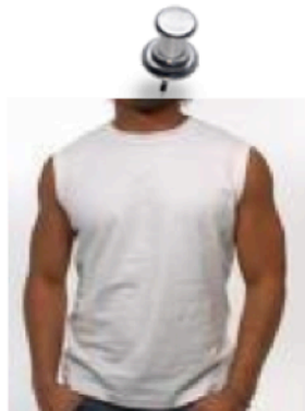
No Sleeveless T-Shirts