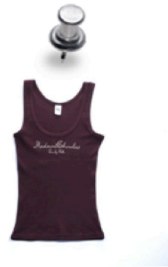
No Tank Top