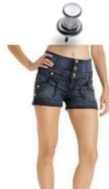
No Short Shorts