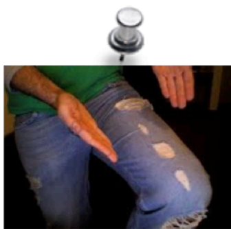
No Holes or Tears Above The Knees