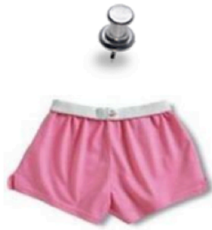
No Sofee Style Shorts