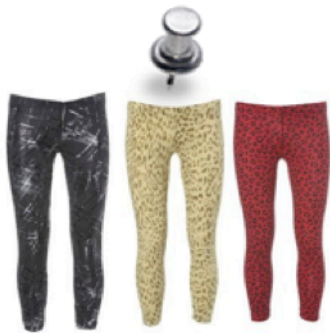
No Leggings as Pants