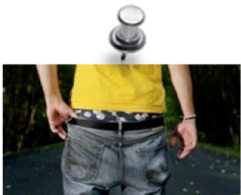
No Sagging Pants